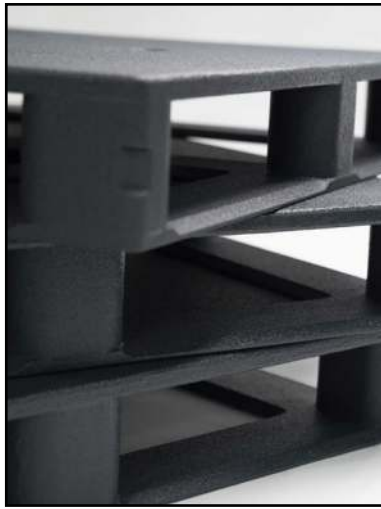
Representation of die-cut venting discs and smart shipping pallet