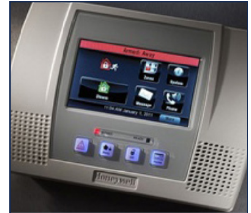
Representation of alarm system control module