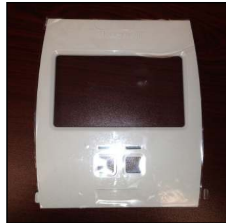
Die-cut protective tape on molded plastic part