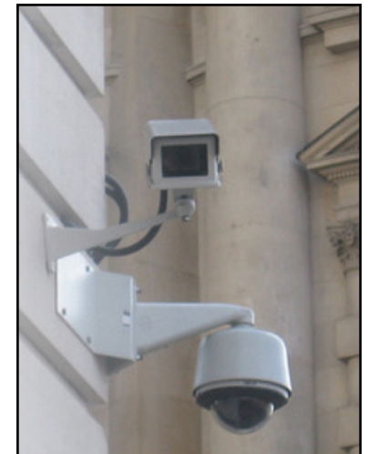
Representations of outdoor camera system