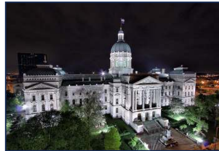
Representation of building with architectural exterior washing lights and custom light shaping diffusing lenses