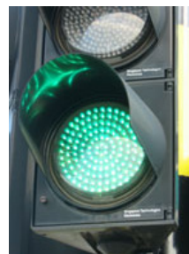
LED Street Light